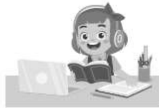
Lots of homework