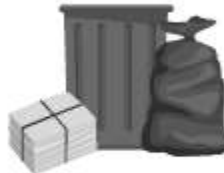
There are just a few dustbins